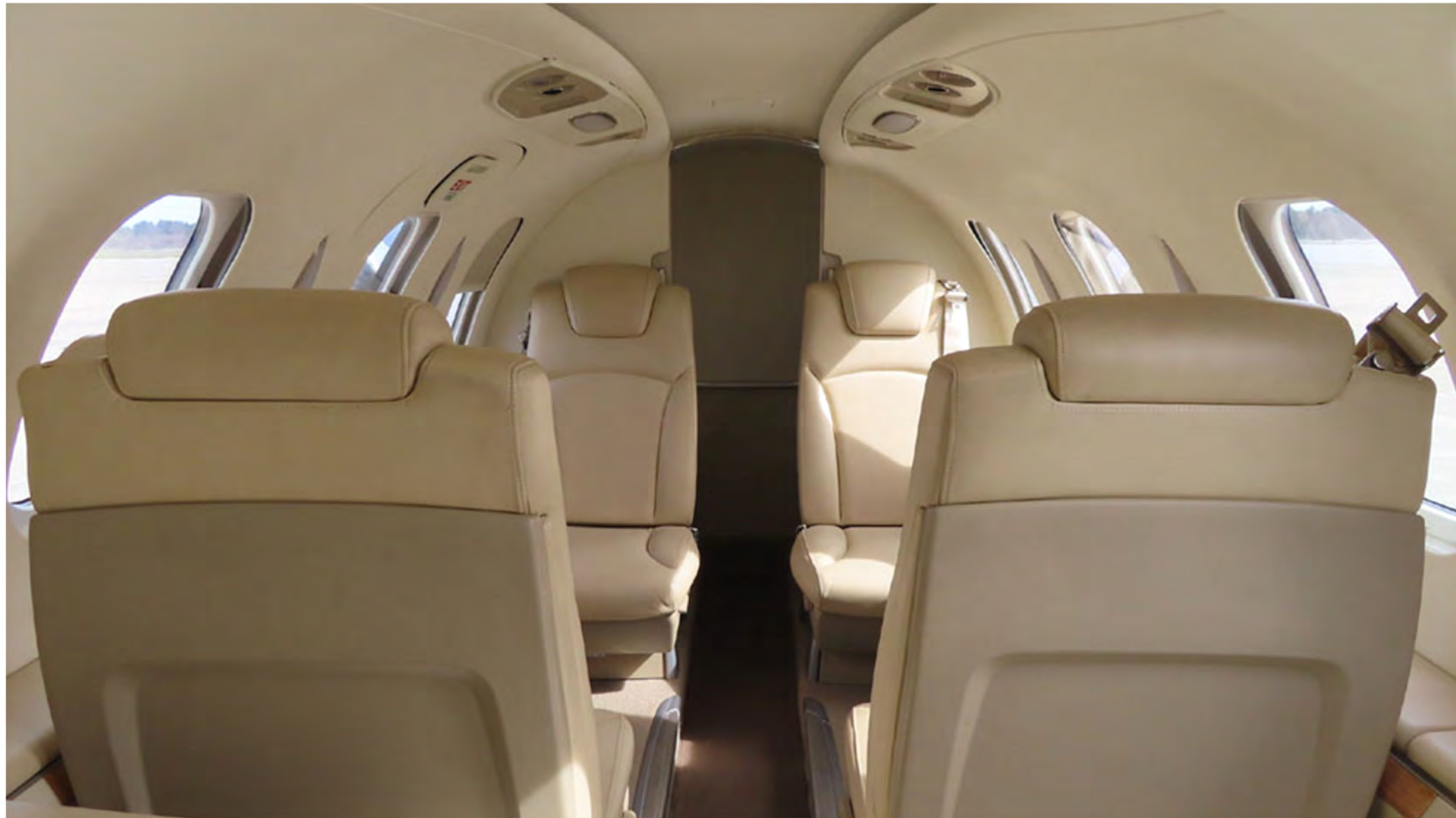
2017 HondaJet APMG, S/N 42000044, N225DB