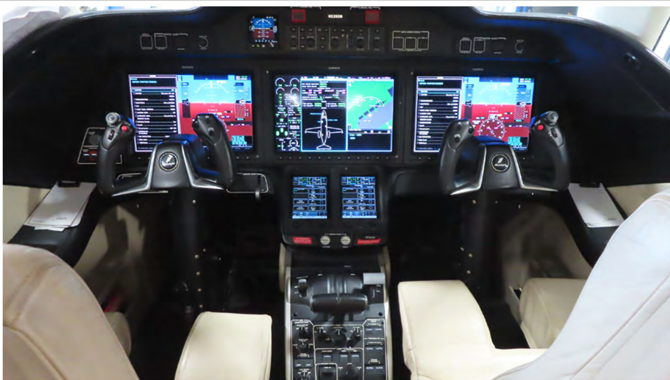
2017 HondaJet APMG, S/N 42000044, N225DB