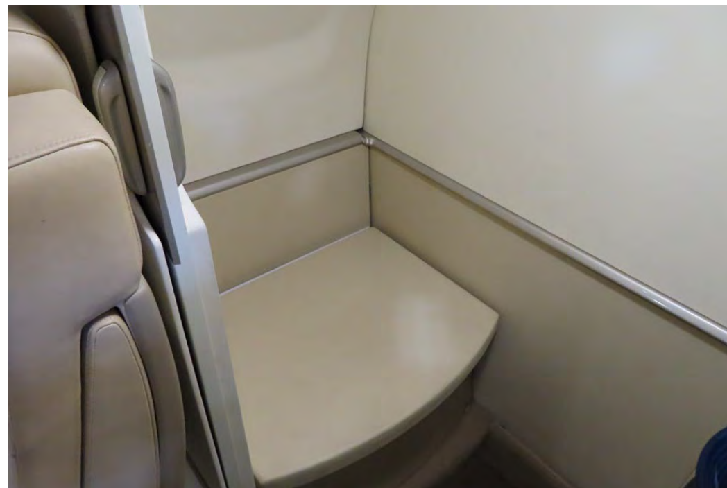
2017 HondaJet APMG, S/N 42000044, N225DB