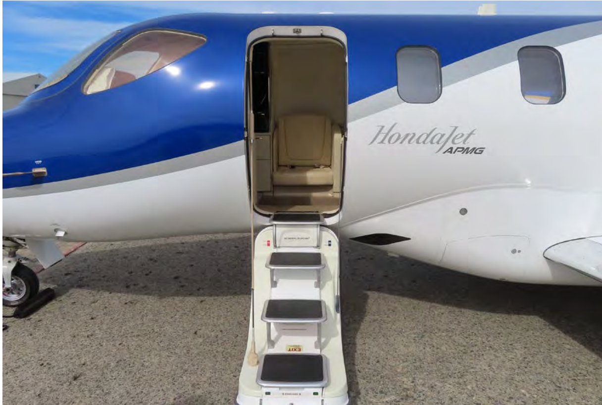
2017 HondaJet APMG, S/N 42000044, N225DB