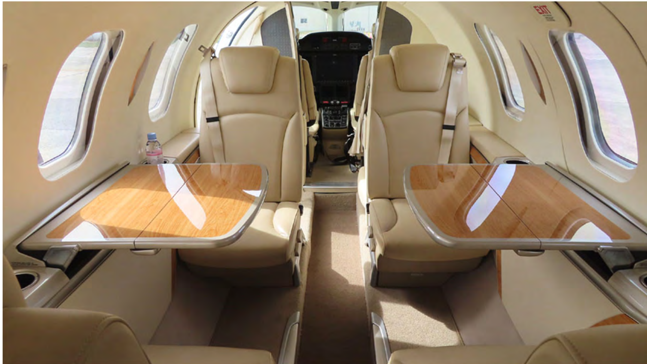
2017 HondaJet APMG, S/N 42000044, N225DB