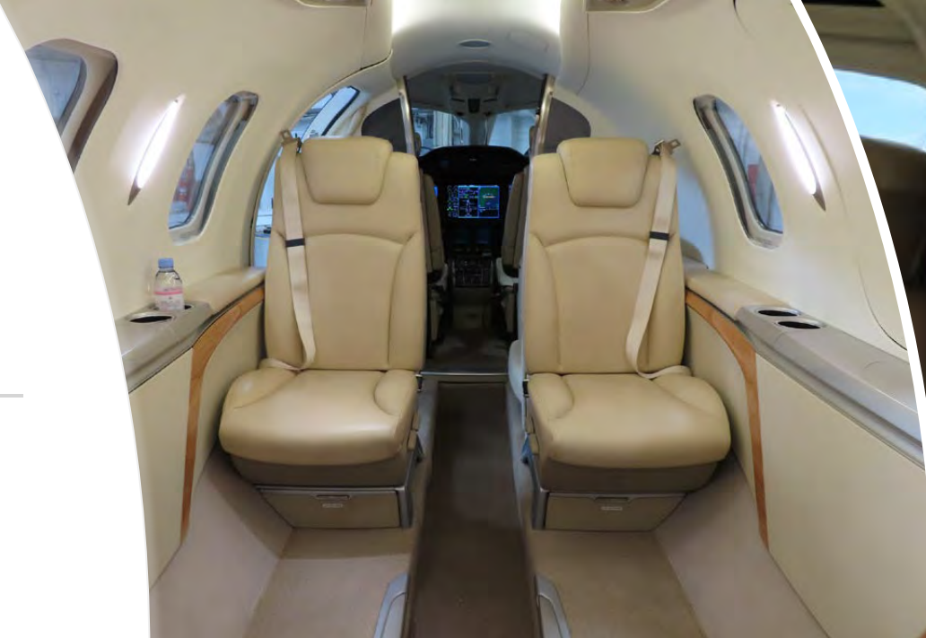
2017 HondaJet APMG S/N 42000044, N225DB