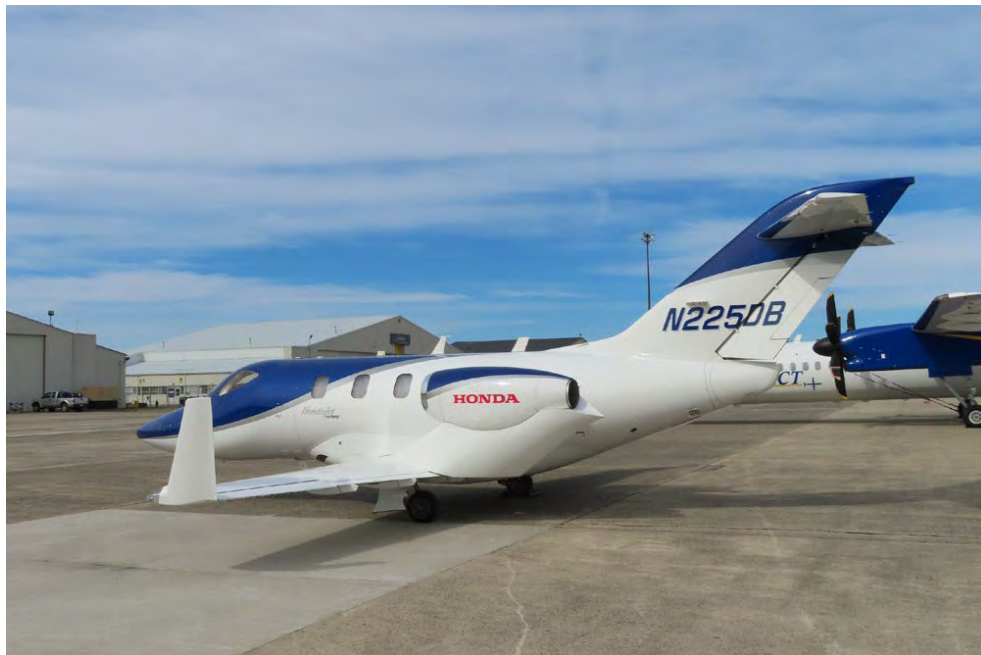
2017 HondaJet APMG, S/N 42000044, N225DB